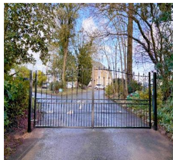
Black Mountain gates fitted us with a brand-new entrance gate

Pre-school have created a larger woodwork area, and their rooms had a freshen up over the summer with new displays created and areas refreshed.